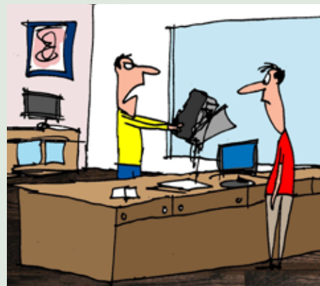
“My computer crashed ... to the ground when I got frustrated and threw it out the window.”