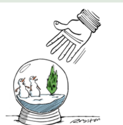
“Looks like we're in for another extreme weather event.”