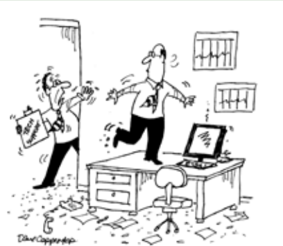
"Hold it! That's not what they mean by 'reboot.'"